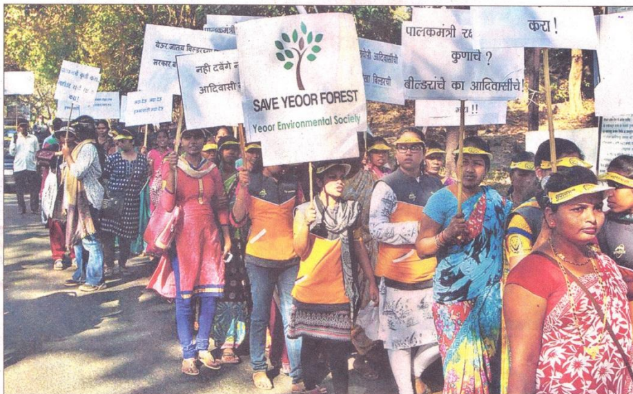
Residents and activists take out a march from Patonepada, Yeoor, to the collector's office at Court Naka on Friday.